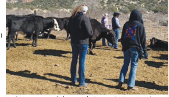
Students observe cattle for signs of calving at the V Bar V ranch.