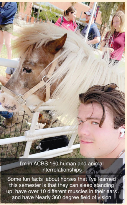
Examples of student selfies created during the ACBS 160 "Animal Encounters" interactive exhibit on the UArizona Mall.