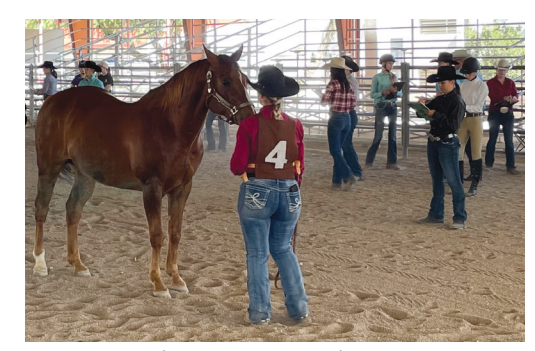
Contestants in the 2022 Sate 4-H Judging Contest compete in the halter judging class.

The award was presented at the 2022 NAEAA Annual Conference, held May 31 - June 2, at Utah University in Logan, Utah.